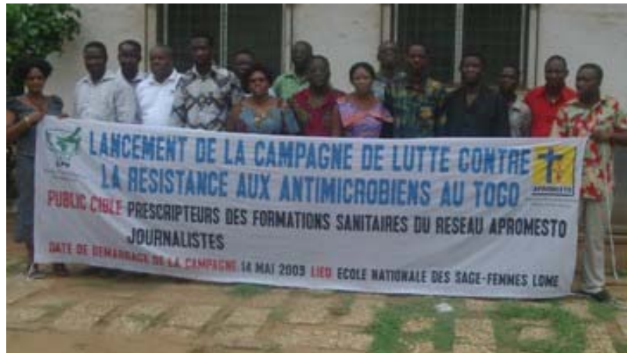
Lome, Togo, May 2009