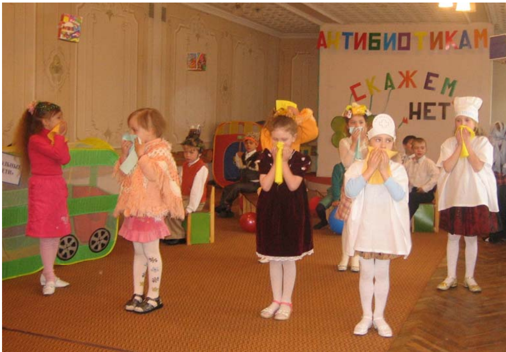
Bricheni, Moldova, May, 2009